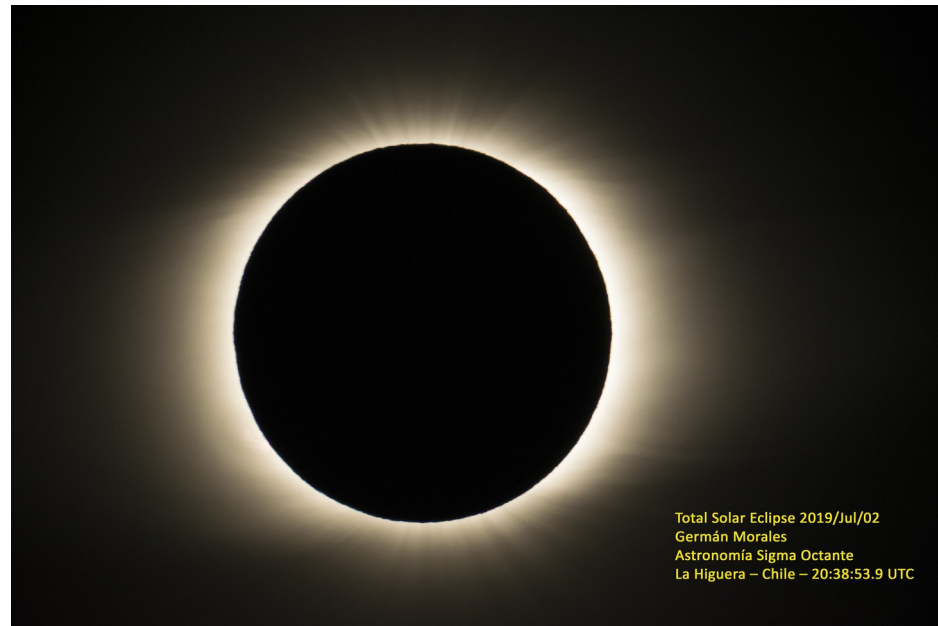
Total Solar Eclipse 2019/Jul/02 Germán Morales Astronomía Sigma Octante La Higuera – Chile – 20:38:53.9 UTC