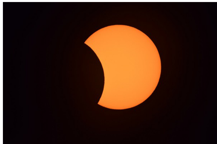
Fig. 1 - Approximately, this will be the aspect of the eclipse at the moment of the maximum, possible to observe from Cochabamba. From the north of the country, a smaller fraction of the solar disk will be covered, and from the south a bit more. From Bolivia, only a partial eclipse will be possible to observe. The photograph corresponds to the sequence obtained in the eclipse of last year, by the author of this note.

All the propaganda that circulates in the media and social networks does not apply to what will be seen from our country; therefore, false expectations should not be held.