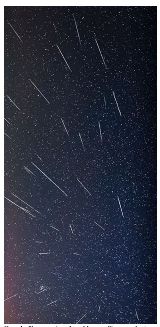
Fig. 1 Photograph of a Meteor Shower; It is a composition of several shots over an hour, where it can be seen that most of the meteors seem to come from a region of the sky, except for some sporadic ones that do not belong to the radiant, as one can see in the image.

From the city (due to the light pollution), and if the radiant is not at the highest point in the sky (Zenith), then that number is lower.